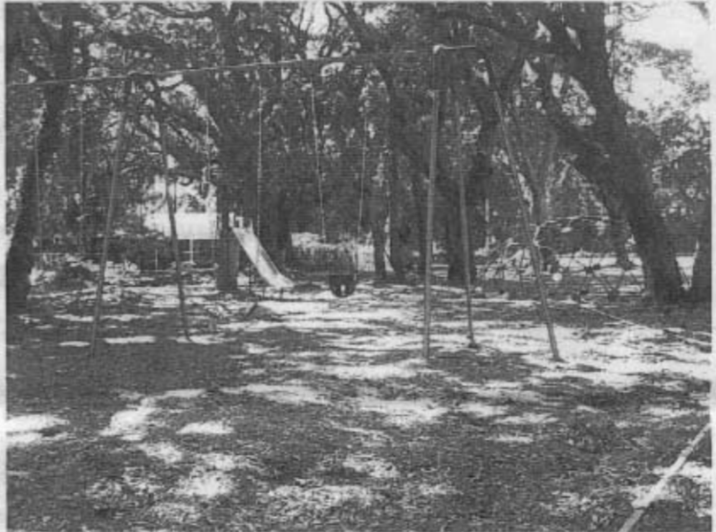
Play Area at Demere Park